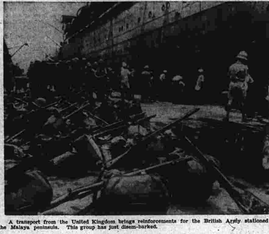
A transport from the United Kingdom brings reinforcements for the British Army stationed on the Malaya peninsula. This group has just disembarked.